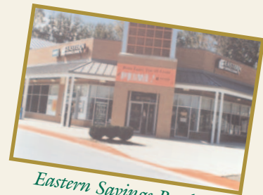
Eastern Savings Bank's Ellicott City Branch

Throughout the 20th century, the financial industry was a roller coaster of successes and failures. Following the Great Depression of 1929, the banking system was in chaos. Banks tried to collect on loans made to stock market investors whose holdings were then worth little to nothing at all, and, unable to raise fresh funds from the Federal Reserve, found their attempts to survive to be quite futile as banks began failing by the hundreds in 1932 and 1933. However, Eastern Savings Bank pulled through hard times and emerged as a healthy financial institution. Having survived the Great Depression, Eastern Savings Bank was optimistic and eager to face any accomplishment or obstacle that lay ahead. Since the 1930s, Eastern Savings Bank has welcomed the advent of new and exciting technologies, including telephone banking and internet banking, which enhances the convenience and ease of banking for our customers.