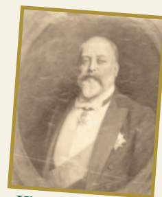
King Edward VII

In 1905 the Edwardian Era, ushered in by the coronation of King Edward VII, was in full swing. This era brought the dawning of a new age and attitude toward life. Tremendous technological and social change occurred, and Americans experienced newfound wealth and indulged in cuisine, fashion, entertainment, and travel. Socialism and communism began to take root in various parts of the world. Eastern Savings Bank was founded on May 29th.