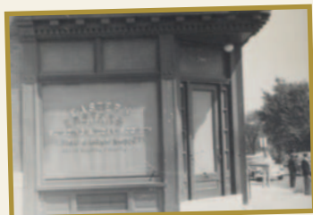
Eastern Building and Loan Society at 701 N. Milton Avenue

The story of Eastern Savings Bank is a story of success. The Bank, then named Eastern Building and Loan Society of Baltimore City, was established in 1905 as a Maryland state chartered mutual building and loan association. By the mid 1900s, Eastern Building and Loan was only one of over 200 small savings and loan associations in the Baltimore area and was open just a few hours every Monday night to cater to its customers' limited needs. Throughout the years, Eastern Building and Loan maintained its neighborhood savings and loan image by catering to a customer base consisting primarily of local area residents.