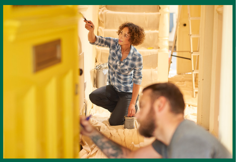
Find out how today: 800.787.LOAN easternsavingsbank.com